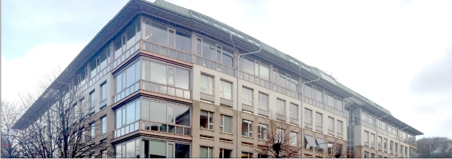
Pilot Building Drivhuset in Göteborg.